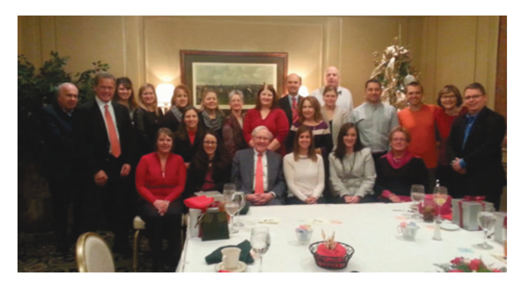
A power lunch, Berkshire-style